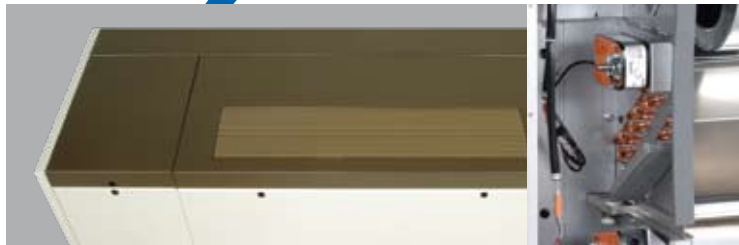
14-Gauge cabinets with pencil-proof clear anodized aluminum bar grilles are available in a variety of one or two-tone colors.