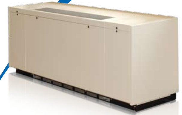
VALEDICTORIAN® UNDER-THE-WINDOW VERTICAL UNIT VENTILATOR